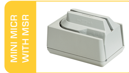
MINI MICR WITH MSR