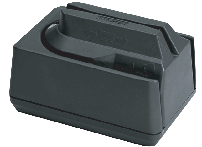
Mini MICR with MSR